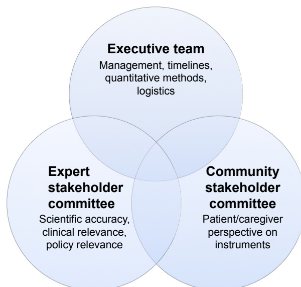
Figure 1 Project governance.

To initiate the project, the expert and community stakeholder committees were engaged to identify areas of greatest need